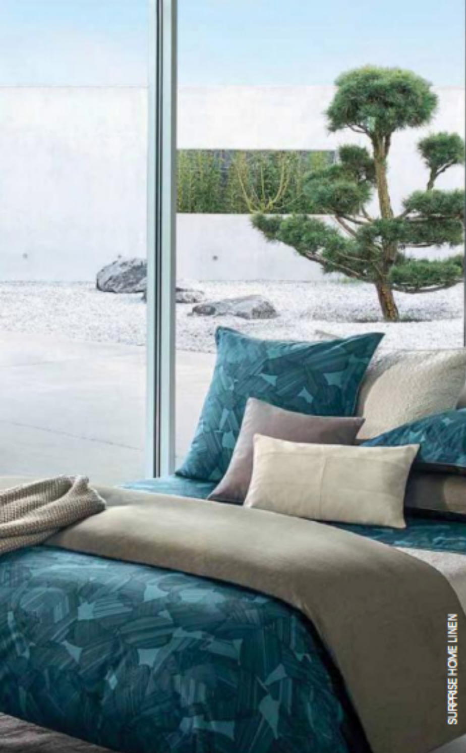
SURPRISE HOME LINEN

#8 Organic wallcoverings with garden themes reminiscent of Senaka Senanayake or Henri Rousseau paintings create a garden like haven, complete with dragonflies, insects, long willowy leaves and foliage in different tones of greens. With a gray backdrop abalone shells, and minerals come in even stronger. This will make a magical impact on one or two walls of the living space or entertainment area. Don't overdo it but the other walls can pick up on the theme in terms of the colour palette. I've done this to my bedroom as a New Year present to me.